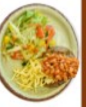
(v) Cheddar Beans D.