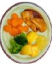
(vg) Quorn Roast G.