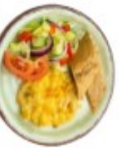
(v) Mac 'n' Cheese G.D.