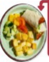
Chicken Fillet Wrap G.