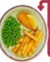
Breaded Fish Fillet F.