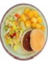
(vg) Veggie Burger in a Bun G.