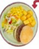
Beef Grill G. SB. in a Bun G.