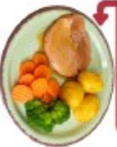
Roast Gannon Steak