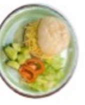
(v) Cheddar Cheese G.D.