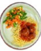
(vg) Plant Power 'Meat' balls