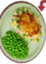
(vg) Quorn Dippers