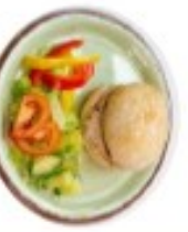
Tuna Mayonnaise F.E.G.