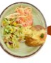
(v) Cheese D.