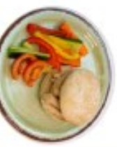
British Roast Chicken G.