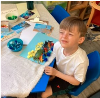
Seaside Loose Part Art Work