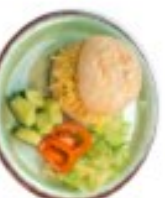
(v) Cheddar Cheese G.D.