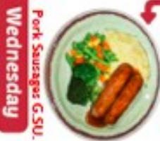
Pork Sausages G.SU.