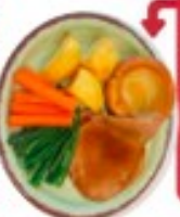
Roast Beef in Gravy, York Pudd D.E.G