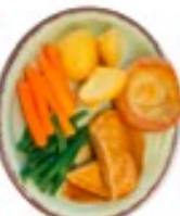
(v) Quorn Roast G. (v) Fresh Peas D.E.G