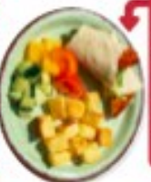
Chicken Fajita Wrap G.