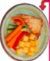
Cheese and Tomato Pizza D.G.