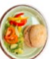
Tuna Mayo Mousse F.E.G