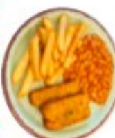
(v) Breaded Vegetable Fingers G.