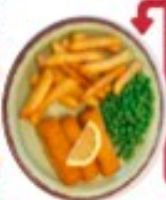
Breaded Fish Fillet Fingers F.