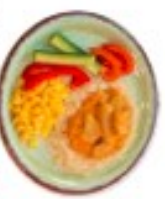
(v) Veg Korma M.D.E.