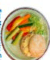
Egg Mayo Mousse G.E.