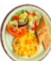
(v) Mac 'n' Cheese G.D.