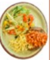
(v) Cheeze Beans D.