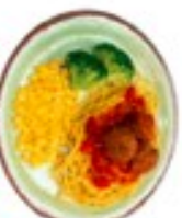
(v) Chinese Soyle Plant Based "Meat" balls Noodles cornish Gluten