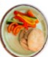
British Roast Chicken G.