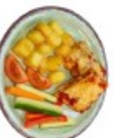
(V) Homemade Vegetable Burrito Bake D.G.