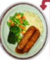
Pork Sausages G.SU.