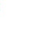
(V) Cheddar Cheese D.G.

All our meals include a carbohydrate accompaniment, seasonal vegetables and/or salad. We offer a choice of fruit juice cordial, semi skimmed milk or water to drink. Some schools offer a hydration station instead, comprising of unlimited chilled water flavoured with fresh fruit. Accompaniments may vary to those shown. PLEASE NOTE some schools serve the cold option in a deli bag with vegetable sticks or salad, a dessert and a drink.