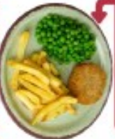
Crispy Salmon Fishcake F.G.