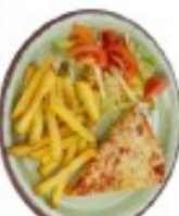
(V) Homemade Cheese & Tomato Pizza D.G.