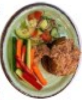
Tuna Mayo D.