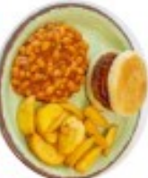
(V) Veggie Breakfast Pattie in a Bun G.D.E.