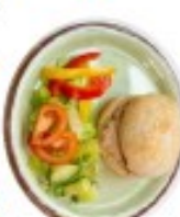
Tuna Mayo F.E.G.