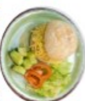
(V) Cheddar Cheese G.D.