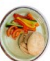
British Roast Chicken G.