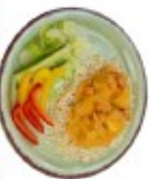
(V) Veggie Korma Curry with Wholegrain or White Rice D.