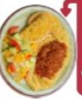
Pasta Bolognese G.Cheese D.