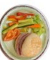
(V) Cheddar Cheese D.G.